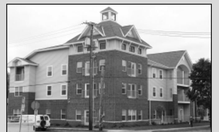
On July 1, residents began moving into the new 32-unit East Phillips Commons located at Bloomington Avenue and 29th Street S. The project received $515,000 from the NRP Affordable Housing Reserve Fund.