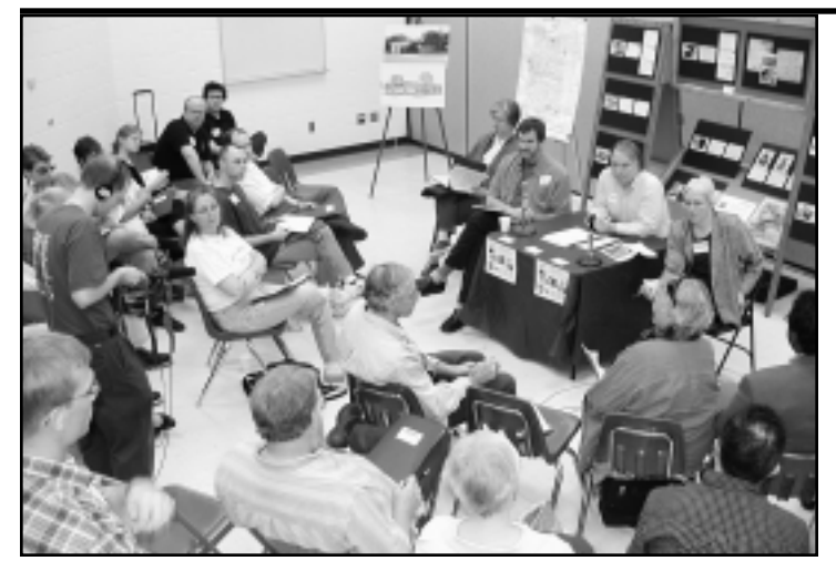
Nearly 100 people attended the NRP Neighborhoods Conference on Saturday, May 17, at the Harrison Community Center. See Page 2 for conference details.

Minneapolis Neighborhood Revitalization Program Crown Roller Mill, Suite 425 105 Fifth Avenue South Minneapolis, MN 55401 Phone: (612) 673-5140