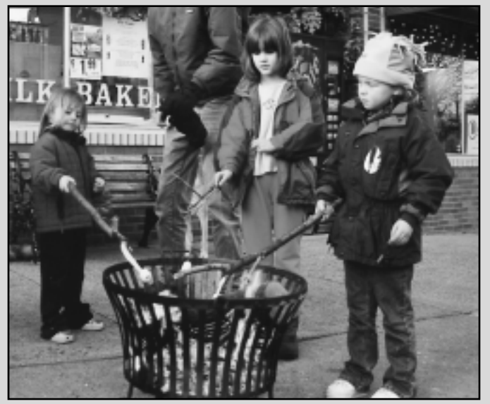
True to the tradition of the Saturnalia festival, children roasted marshmallows over open fires at several locations along Cedar Lake Road in downtown Bryn-Mawr. Roasted chestnuts and hot apple cider were also available inside all of the downtown eateries.

The Bryn-Mawr festival included activities for all ages. Gardening enthusiasts enjoyed a winter flower arrangement demonstration and kids learned how to make wreaths. There were also hay rides, performance artists, a roving accordion player, and open fires for roasting marshmallows and chestnuts. Hot chocolate and hot apple cider were available to festival goers in each of the downtown eateries. Highlights from Bryn-Mawr's Saturnalia winter festival will be featured in mid-February on the NRP's Minneapolis Neighborhood News cable television program. You