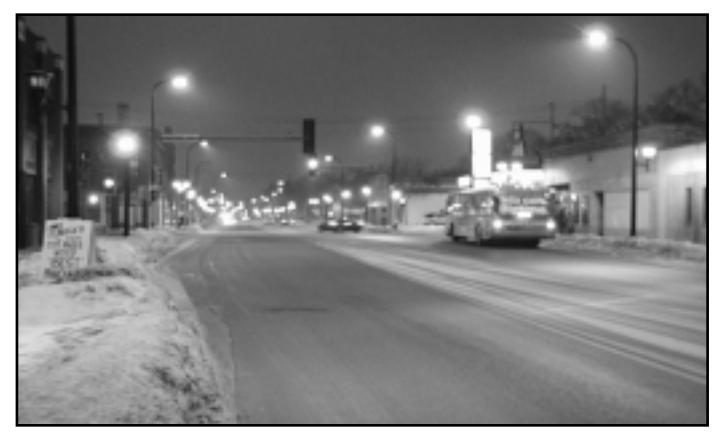
Residents in the Phillips neighborhood invested $300,000 of NRP funds in the Franklin Avenue Streetscape project.

The NRP has always made a strong showing at the CUE Awards and this year should be no different as the program was involved in eight of the 34 project finalists. They include: East Village, a 179-unit mixed-income, mixed-use housing development; Agape Dos, a home for people living with AIDS; the Playwright's Center, a performance theater in the Seward neighborhood; the Franklin Avenue Streetscape, a $3.8 million renewal project that spans from Chicago Avenue to 16th Avenue; the Southeast Minneapolis Industrial Plan, a multineighborhood effort to redesign and reconstruct the southeast industrial area; and the Humboldt Greenway Plan, an initiative that will result in the construction of nearly 200 new single-family homes and townhomes on an eight-block stretch of Humboldt Avenue North. Tickets to the CUE Awards presentation cost $30. If you would like to purchase a ticket, please call CUE at 612-673-3014.